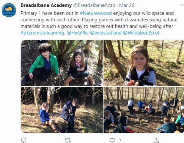
PI – Nature's Wood