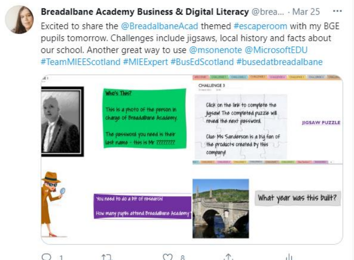
Business Education – Digital Escape Room