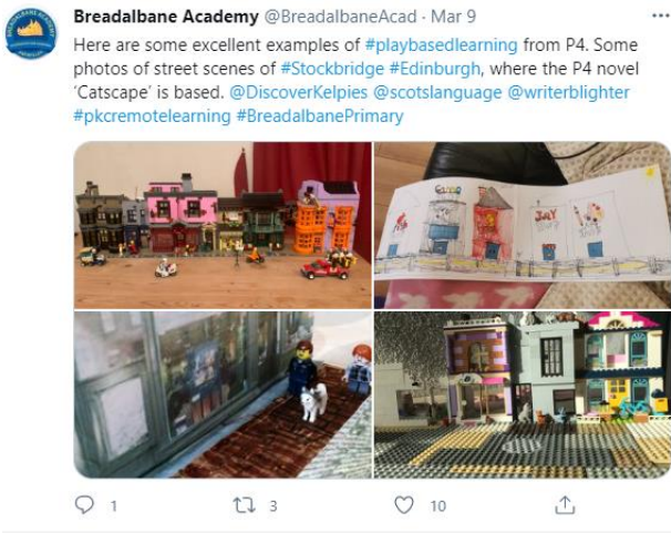
P4 - Play Based Learning