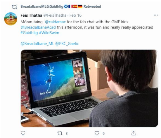
GME – External Speakers