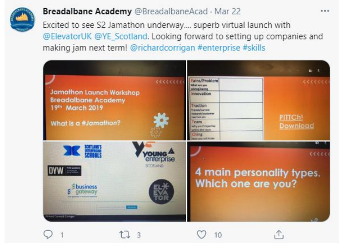
S2 - Jamathon